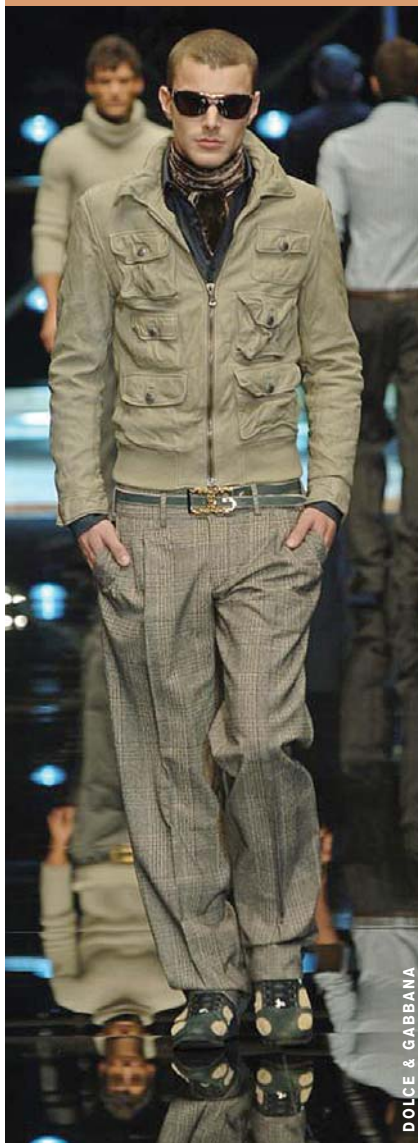
DOLCE & GABBANA

New to the battlefield are aviation-inspired and high-ranking uniforms. Jackets and vests feature bomber and cargo pocket styles. Neutrals such as tan and army green are classic, though gray tones are getting heavy attention this fall.